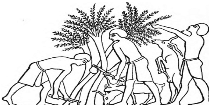
Copied from Erman. FIG. 4.—FELLING PALMS, GOATS BROWSING ON THE FOLIAGE.