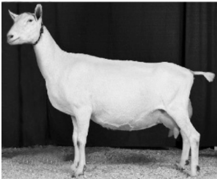
CH Century Farm's Hillary