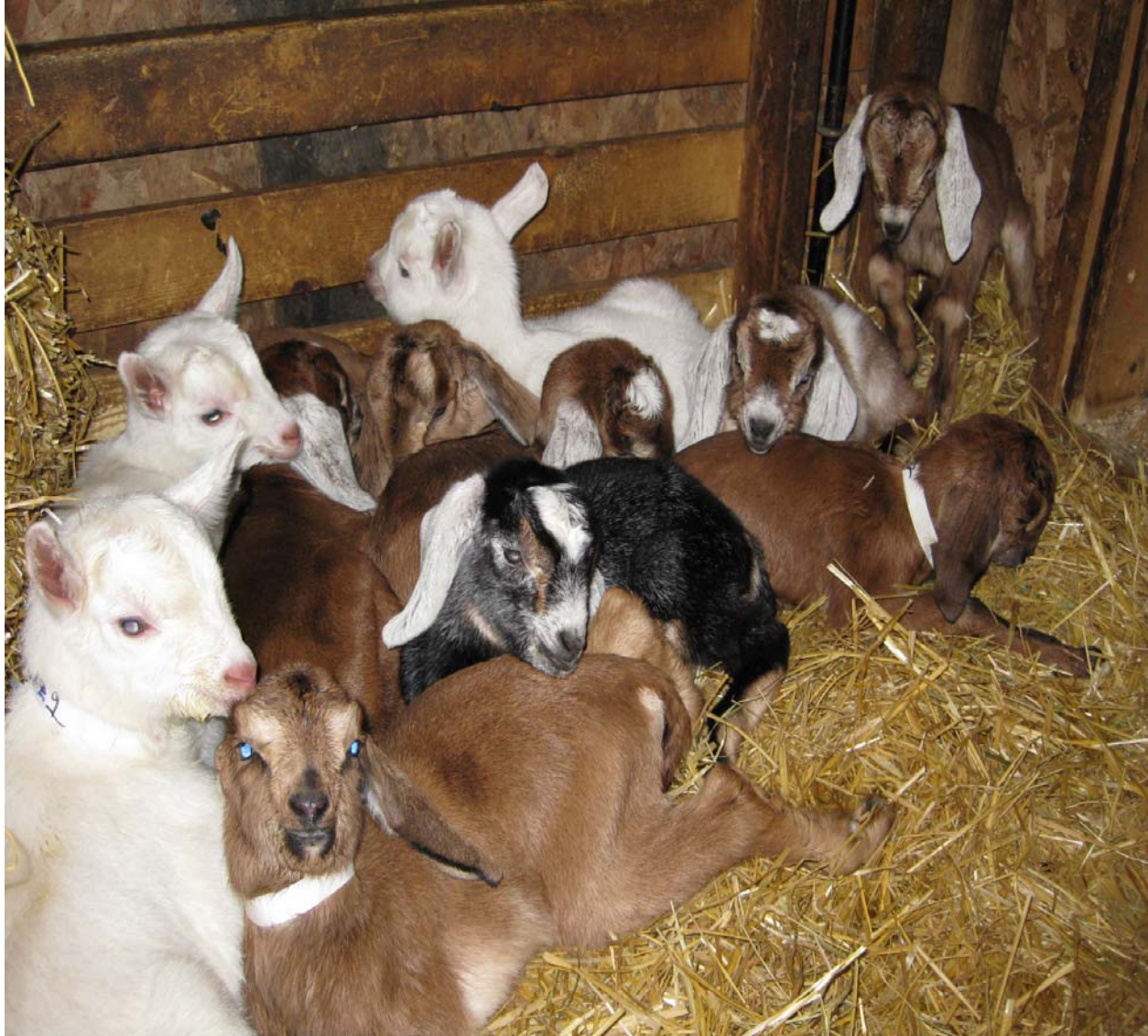
Spring kids at Four Seasons Farm. Thanks to Laura Kieser for the picture.